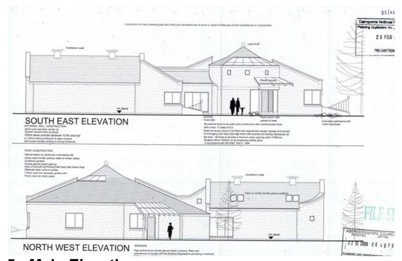
Fig 5 - Main Elevations