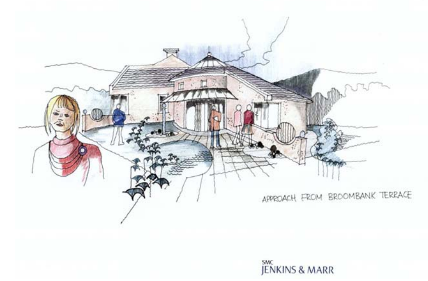
Fig 4 - Sketch Entrance Elevation