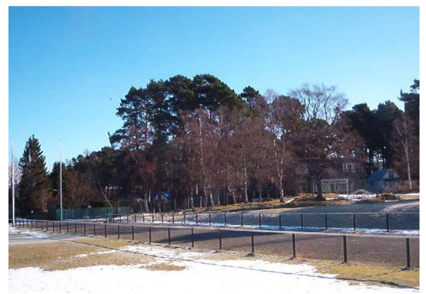
Fig 3 - View to Site from Games Park