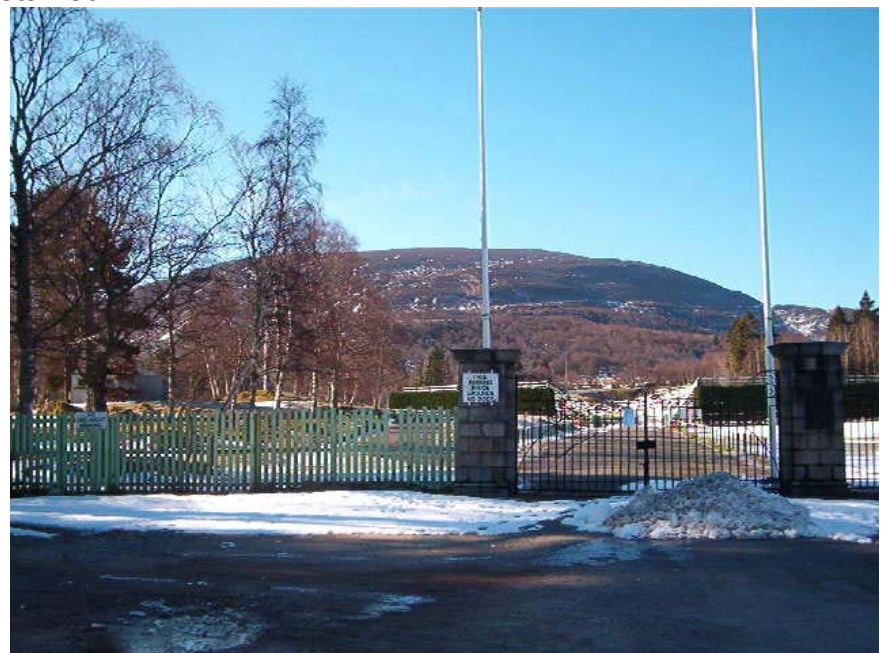
Figure 2 - Entrance to Games Park, Site for New Building on left of photograph

3. The site is where the world famous Braemar Highland Gathering is held every year. The purpose of the proposed development is to provide a new administrative centre to replace the existing small building within the village that the games are run from. This building is some distance away from the Games Park. The proposed new building would provide administrative and interpretative facilities for the site and would also be capable of hosting community events. A detailed supporting statement is attached at the back of the report setting down the justification and facilities to be provided.